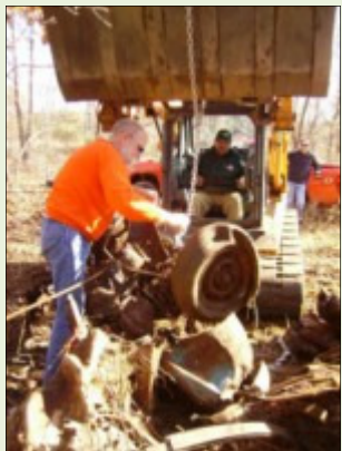
Skid loader handling large pieces.

Our primary objective was to remove as much of 4 remaining cars from the 2009 Pax River Trashout and we were successful. The cars were spread out so there were essentially three separate sites being worked. Thanks to the sponsorship and the efforts of the Paddlers, car-chunking was done in the week before we got there. The goal was to cut the cars into pieces that could be handled by the winches and loaded into the bed of a pickup truck by human power. They were able to chop two of the cars with a full day's work. That left two that were relatively whole.