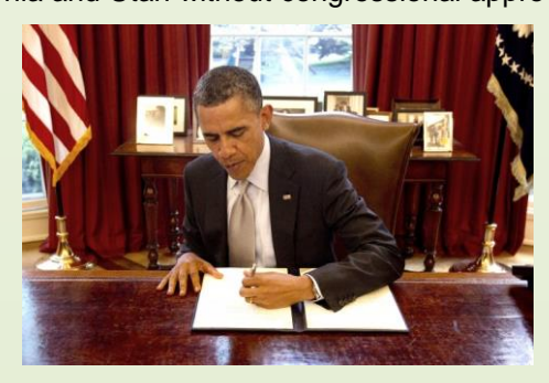
President Barack Obama signs a proclamation in the Oval Office of the White House on April 20, 2012, to designate federal lands within Fort Ord, a former military base located on California's Central Coast, as a National Monument under the Antiquities Act.

Act. With that designation, the federal government can restrict all sorts of activities on the land, including ranching, off-roading and energy production — disregarding the wishes of local communities. Obama can effectively rope off millions of acres in states like California and Utah without congressional approval.