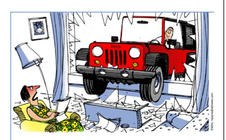
"For crying out loud, Tom! Why can't you come in through the front door like everyone else?!"