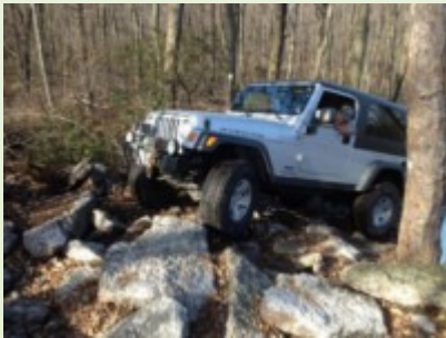
Paul Lepine on blue trail 36.

we pulled off the trail and spotted for a lunch next to a nicely running stream.