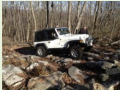
Mike and Donna on blue trail 36.

the park. We proceeded along N1 and were presented with some hill descents and rocky challenges. What struck us all was that the set of green trails in the Northeast section of the park were more challenging than those in the other section of the park.