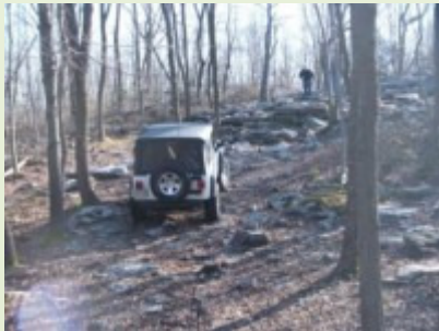
Challenges on blue 36..

a later start. Instead of the normal 6:30 AM meeting time, we chose a 7:30 AM meeting time in Urbana MD, with a planned arrival time at Rausch Creek Off Road Park ( http://www.rauschcreekoffroadpark.org/ ) around 10 AM. The weather forecast for the day promised to be spectacular, sunny and temperatures in the mid 50's; a special treat for this trip as the weather on prior CORE Black Friday runs has not been as kind.