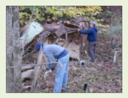
Cutting up the cars.

expression about boat anchor blocks and this one qualified. As Mike pulled the slack out of the winch line, the Jeep started to be pulled across the leaves rather than the engine giving. Strategic parking with the bumper braced on a tree won out and engine started the climb up the hill.